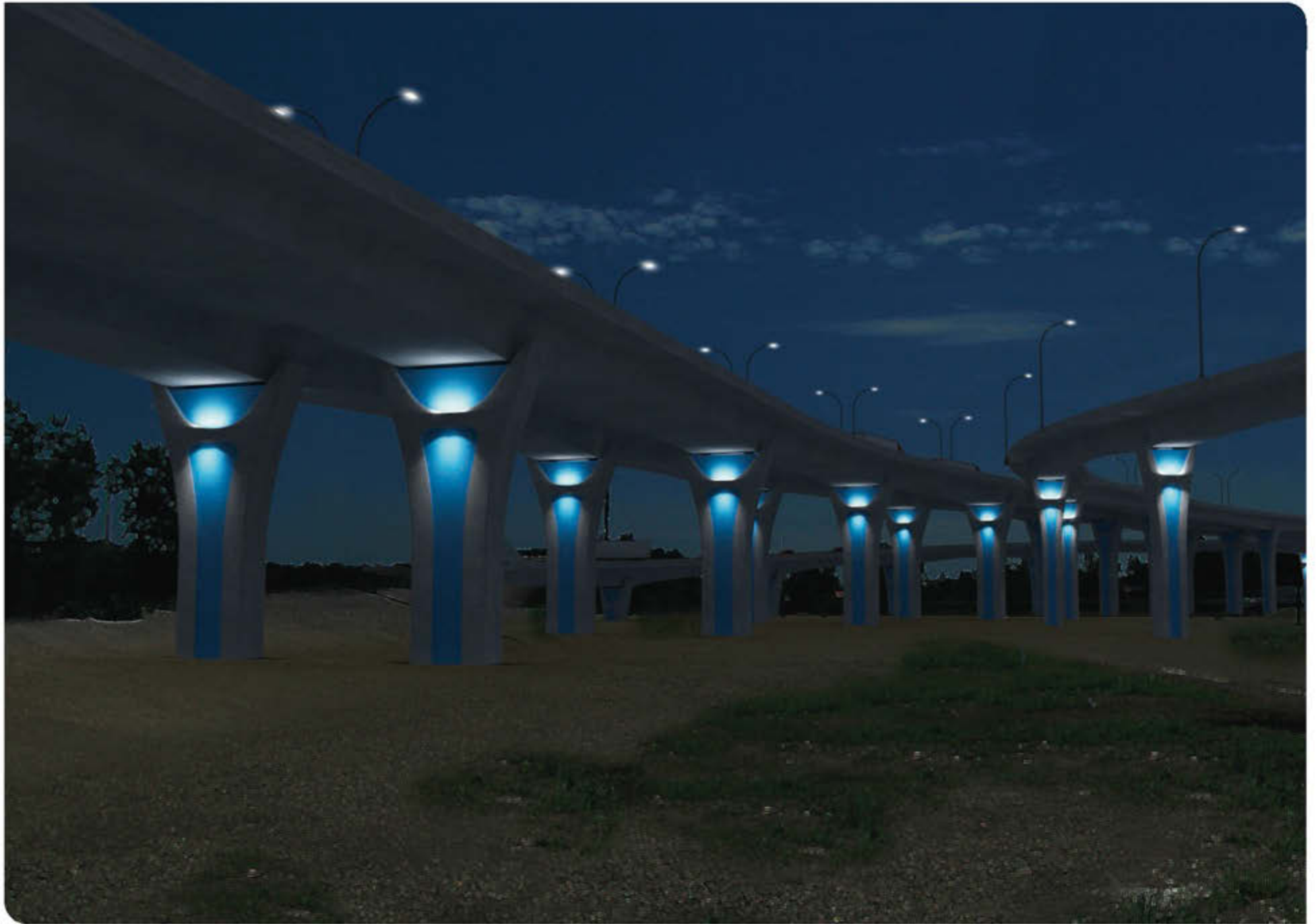
CLINE AVENUE BRIDGE (rendering) | East Chicago, Lake County, Indiana View Looking East Near Riley Road Interchange