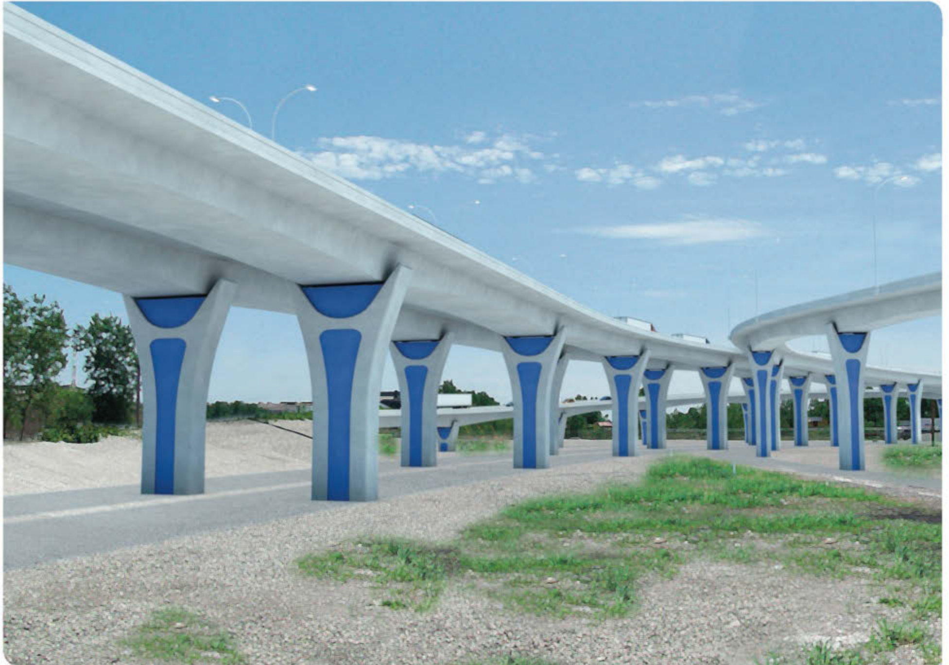
CLINE AVENUE BRIDGE (rendering) | East Chicago, Lake County, Indiana View Looking East Near Riley Road Interchange