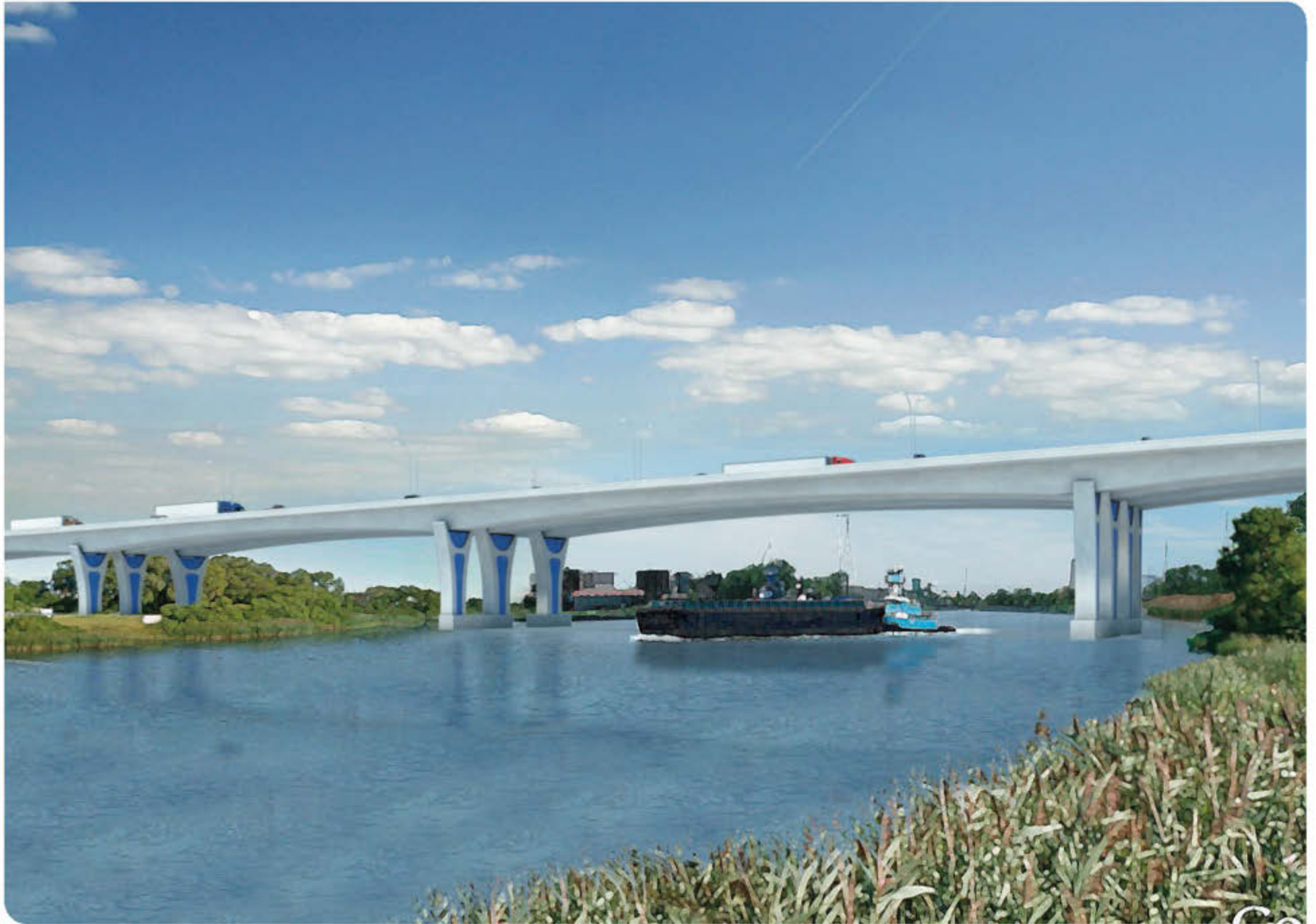
CLINE AVENUE BRIDGE [rendering] | East Chicago, Lake County, Indiana View Looking Northeast From Indiana Harbor & Ship Canal