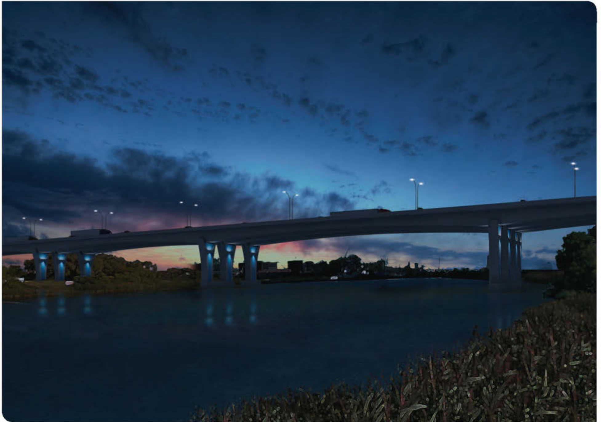
CLINE AVENUE BRIDGE (rendering) | East Chicago, Lake County, Indiana View Looking Northeast From Indiana Harbor & Ship Canal