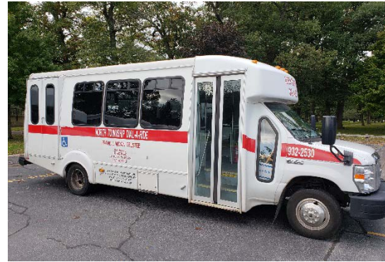
Picture of Bus 16

2013 Ford E450 Body on Chassis Bus Vehicle Number 16 Serial Number B35617 Approximate Mileage – 101,610 Minimum Bid - $500