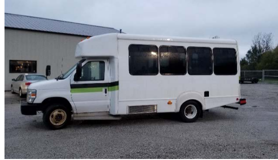
Picture of Bus 95

2010 Ford E450 Body on Chassis Bus Vehicle Number 95 Serial Number A21069 Approximate Mileage – 199,726 Minimum Bid - $500