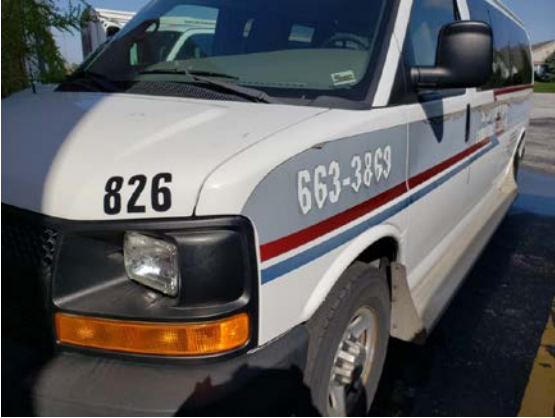
Picture of Van 826