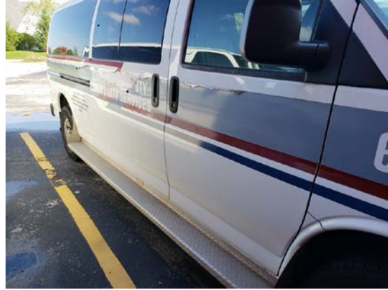
Picture of Van 826

2011 Chevrolet Express – 15 Passenger Van Vehicle Number 826 Serial Number B1185975 Approximate Mileage – 91,874 Minimum Bid - $500