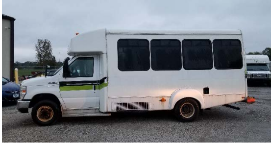
Picture of Bus 90