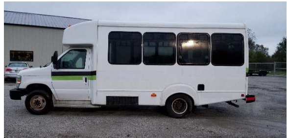
Picture of Bus 94

2010 Ford E450 Body on Chassis Bus Vehicle Number 94 Serial Number A21070 Approximate Mileage – 180,115 Minimum Bid - $500