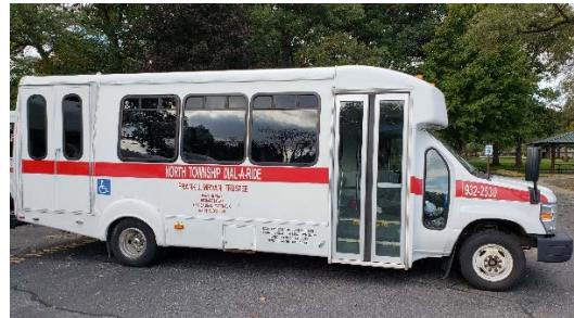
Picture of Bus 15

2012 Ford E450 Body on Chassis Bus Vehicle Number 15 Serial Number A06640 Approximate Mileage – 112,785 Minimum Bid - $500