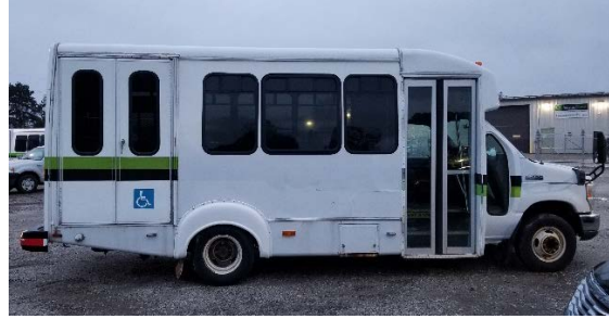
Picture of Bus 90

2009 Ford E450 Body on Chassis Bus Vehicle Number 90 Serial Number A32718 Approximate Mileage – 176,301 Minimum Bid - $500