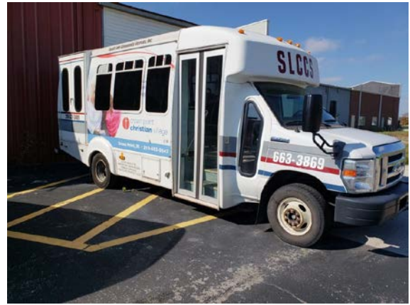
Picture of Bus 935

2012 Ford E450 Body on Chassis Bus Vehicle Number 935 Serial Number B24615 Approximate Mileage – 131,043 Minimum Bid - $100