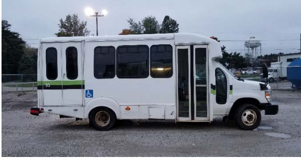
Picture of Bus 95