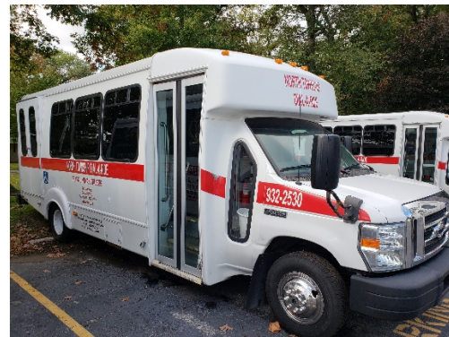
Picture of Bus 17

2013 Ford E450 Body on Chassis Bus Vehicle Number 17 Serial Number B35618 Approximate Mileage – 97,379 Minimum Bid - $500