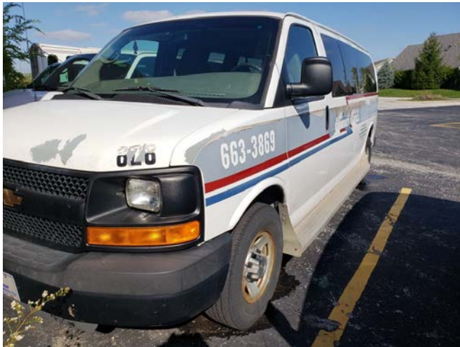
Picture of Van 828

2011 Chevrolet Express – 15 Passenger Van Vehicle Number 826 Serial Number B1185975 Approximate Mileage – 91,874 Minimum Bid - $500