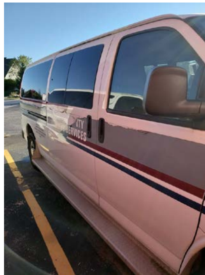
Picture of Van 828

2011 Chevrolet Express – 15 Passenger Van Vehicle Number 828 Serial Number B1186481 Approximate Mileage – 74,325 Minimum Bid - $500