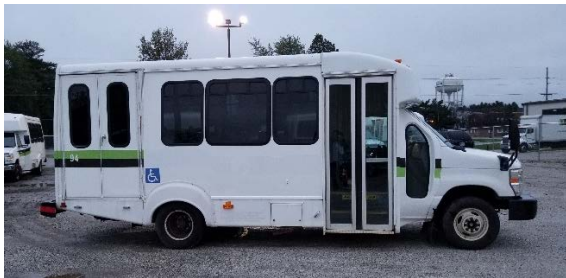
Picture of Bus 94

2009 Ford E450 Body on Chassis Bus Vehicle Number 90 Serial Number A32718 Approximate Mileage – 176,301 Minimum Bid - $500